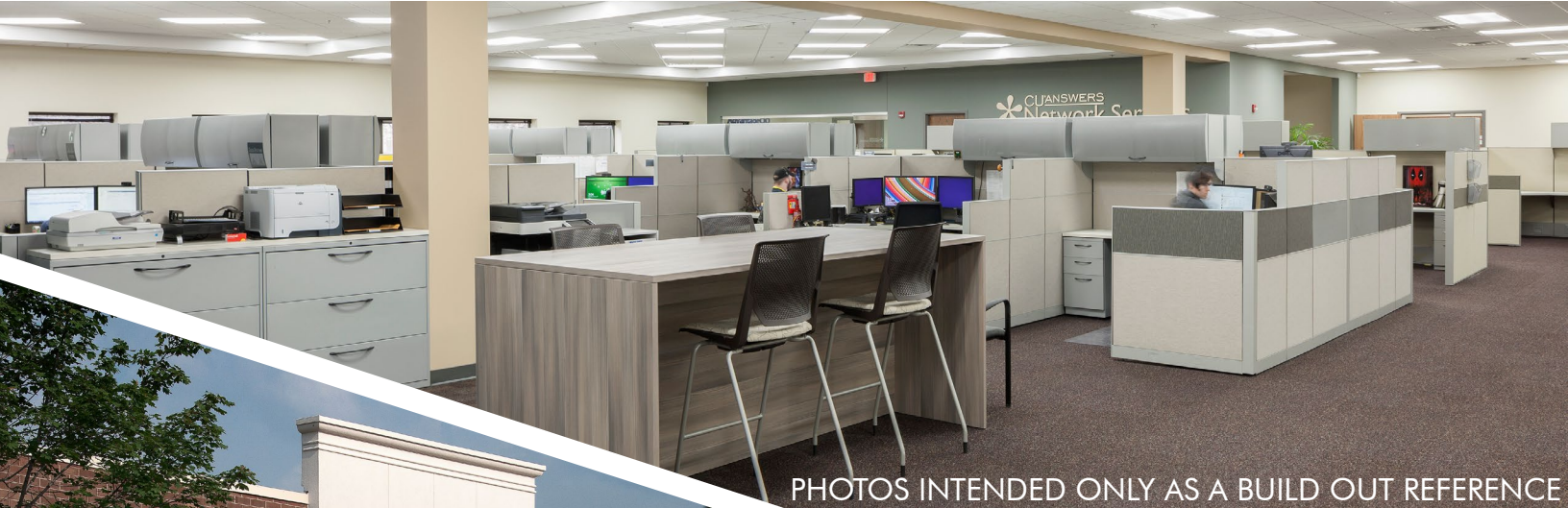
PHOTOS INTENDED ONLY AS A BUILD OUT REFERENCE

4635 44TH STREET SE | GRAND RAPIDS, MI 49512